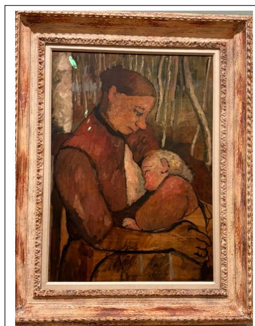
Above: Nursing Mother in Front of Birch Forest 1905