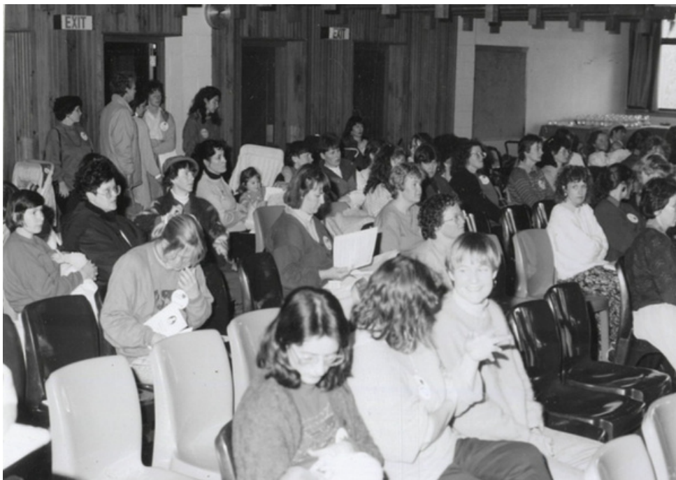
Conference, August 1991, Waikato