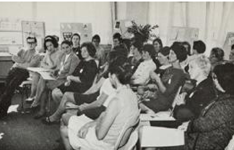
FIRST LLLNZ CONFERENCE, MAY 1969, HAMILTON