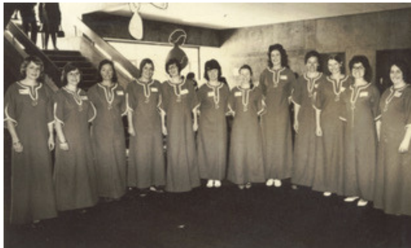
CONFERENCE, NOVEMBER 1974, PALMERSTON NORTH