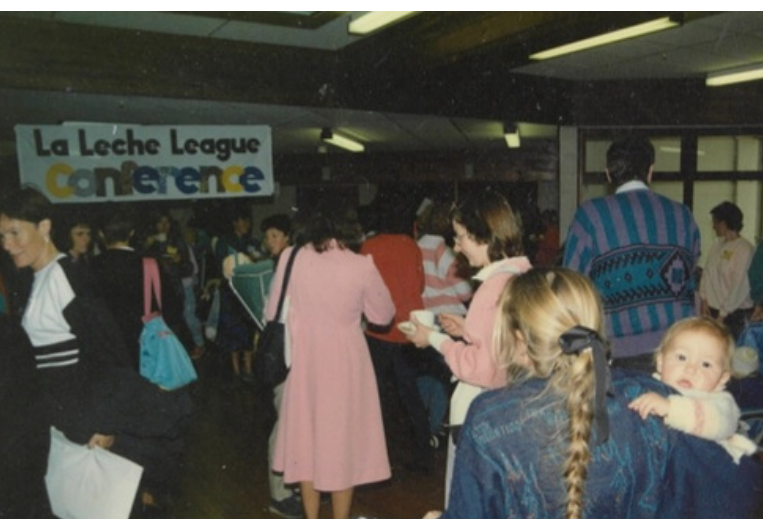
CONFERENCE, MAY 1988, HAMILTON