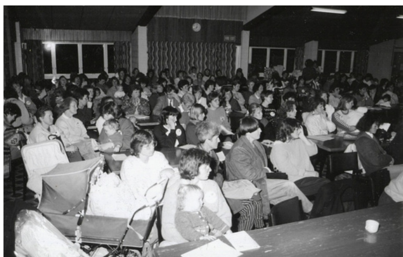
CONFERENCE, AUGUST 1991, WAIKATO