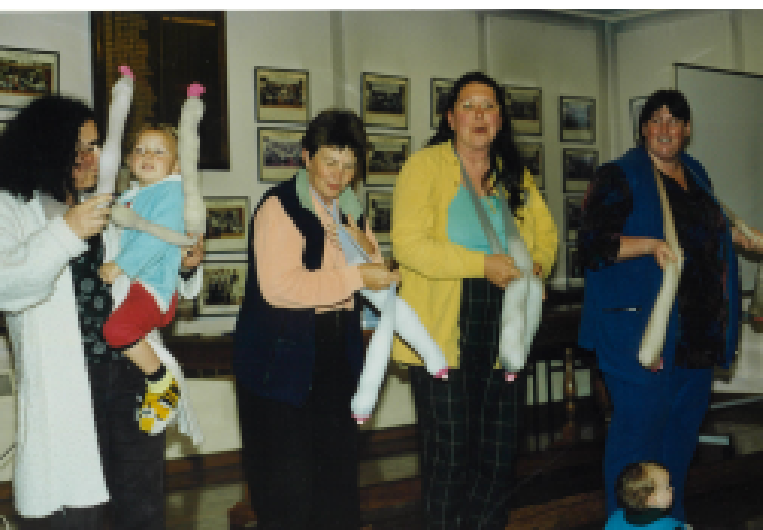
CONFERENCE, SEPTEMBER 2000, CHRISTCHURCH