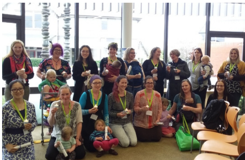
CONFERENCE, OCTOBER 2018, CHRISTCHURCH